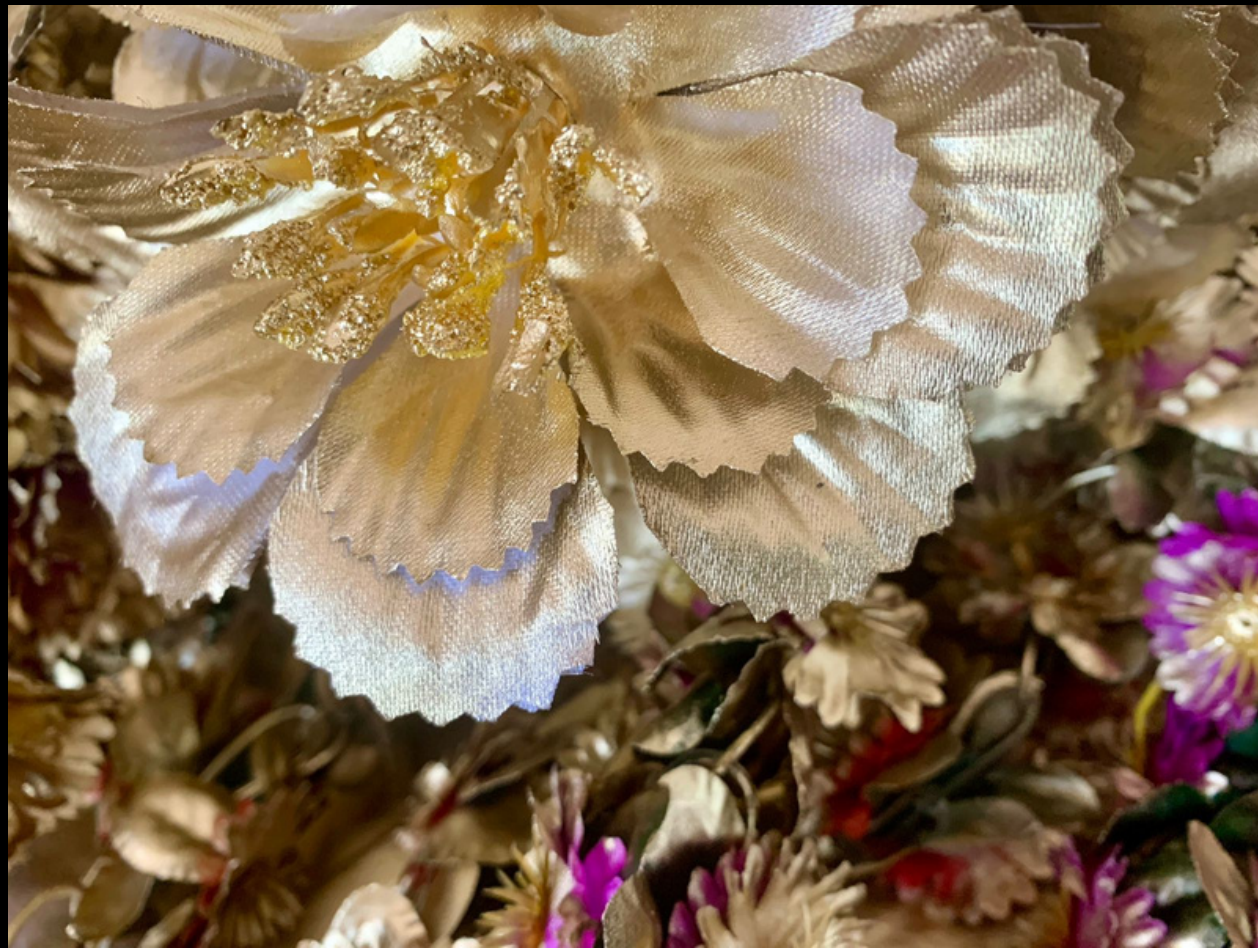
All That Glitters Variable P.O.V