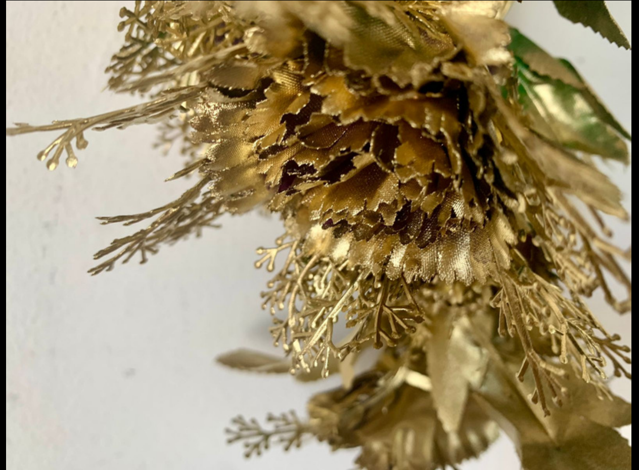
All That Glitters Variable P.O.V