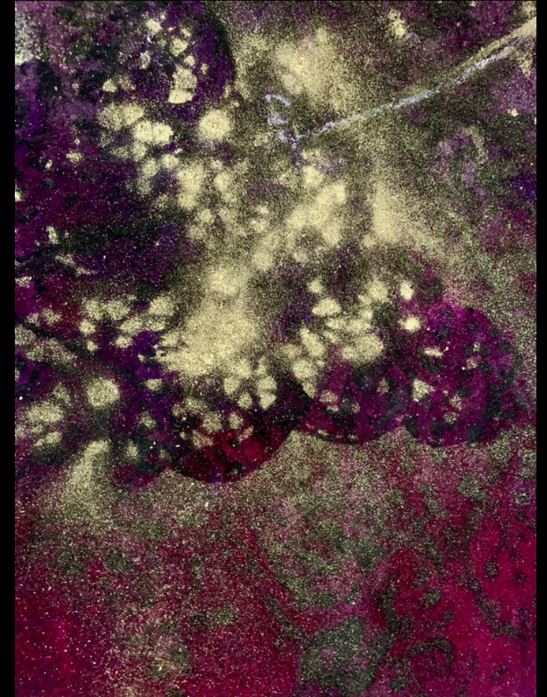
Under The Table