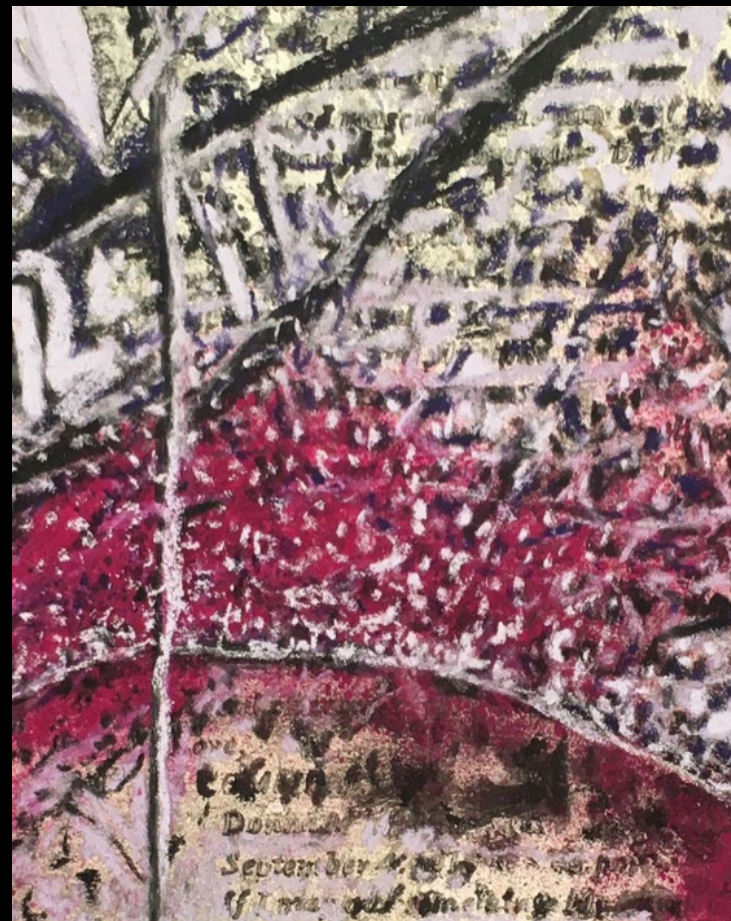
Word Land 50cm x 65cm R40,000.00